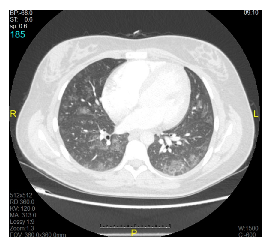
Figure 1. Computerised tomography (CT) image of a pregnant woman with acute respiratory distress syndrome (ARDS).

The mean \pm SD of the gestational age of all the born babies in this study was 31.43 \pm 4.35 . The main clinical symptoms on admission to the MICU were dyspnoea, coughing, and fever, which were present in 16 of 19 patients (84.21%). All 19 patients had bilateral infiltrates seen on a chest X-ray (CXR) or computerised tomography (CT) scan, along with a certain degree of ARDS. The most common findings during examination of the chest CT were bilateral diffuse ground glass-like infiltrations and pneumonic consolidation areas. On the chest X-rays, diffuse bilateral infiltration and increased opacity were seen (Figures 1 and 2).